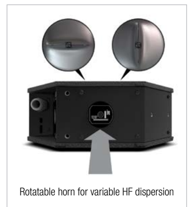
Rotatable horn for variable HF dispersion

For applications that require the greatest degree of customisation, the ID24c enables specifiers to choose from an expanded range of HF directivities, mounting and connectivity options. Cabinets can be spec'd in black, white or any custom RAL colour with matching steel, fabric or foam grilles.