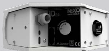
ID24i - Install version