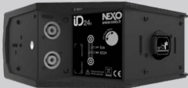
ID24t - Touring version