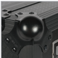
Heavy and powerful Steel Ball corners