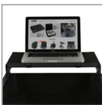
An extra notebook shelf included for your notebook

We, at UDG have further fine-tuned already a great design concept of our flight case into one specially for the most discerning DJ/producer. Constructed from solid 9mm thick plywood, the outside is laminated in a black finished honeycomb/hexagonal "Stage Grip" pattern. The inner sides are protected with high density diamond embossed EVA foam protective padding. This is extremely robust padding protects the equipment against scratches, dust or other damages, creating a unique stylish & practical finish.