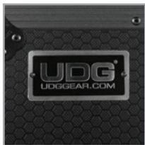
High grade aluminium UDG logo plate