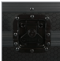
Recessed Butterfly Twist latch lock