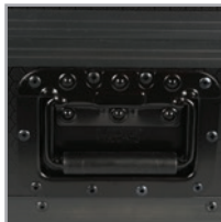
UDG spring-loaded handles