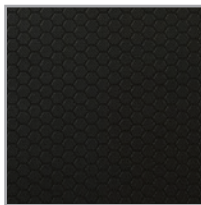
Laminated in a black finish with a honeycomb/hexagonal "Stage Grip" pattern