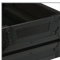
Removable case lid