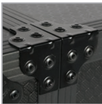
Extra-wide black solid aluminum profiles