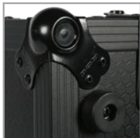
Industrial strength rubber feet at the bottom