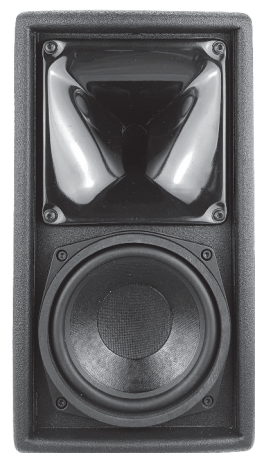
Grille removed, the large PS horn used with the HF driver

ePS6 acoustic phase response is NEXO phase signature allowing inter-operability between all NEXO speakers at all crossover points, except for the monitor setups where latency is minimized.